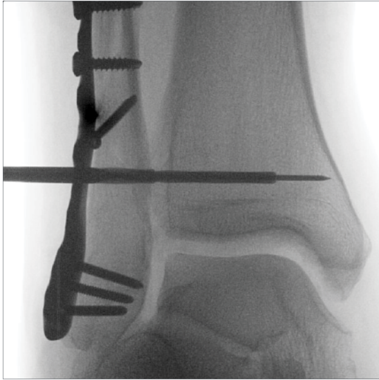
Figure 4. (A) Step Drill

Next, the cannulated step drill is used to carefully drill the fibula and tibia (Figure 4 A,B). It is very important to not penetrate the tibia with the larger portion of the drill. Fluoroscopy should be used throughout this portion of the procedure. The drill and wire are then removed.