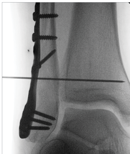
Figure 3. K-Wire Placement

While maintaining reduction, and with the aid of fluoroscopy, the K-wire is then introduced through the fibula into the tibia 2-3 cm proximal and parallel to the joint line, with a 20-30 degree anterior trajectory. The K-wire should not penetrate the medial cortex of the tibia, so to not damage the saphenous neurovascular bundle (Figure 3).