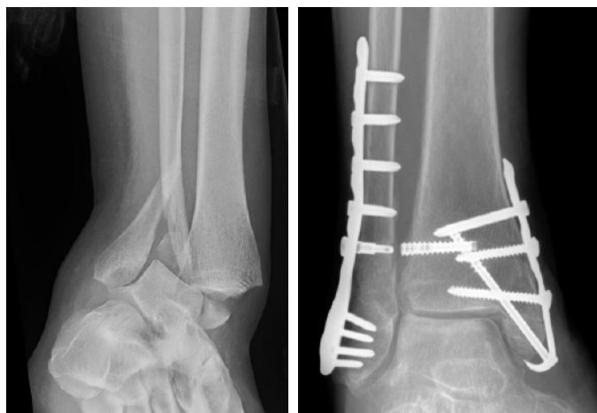
Figure 7. (A) SER Injury (B) 12-month follow-up

Average time of follow-up was 9.5 months. At the last follow-up, all patients had favorable results with American Orthopedic Foot and Ankle Society and Visual Analog Scale scoring systems (mean score of 94, varying slightly by type of injury, gender, and age, with a range of 97-100) along with radiographically healed fractures without rewidening of the syndesmosis. There were no complications in this series.