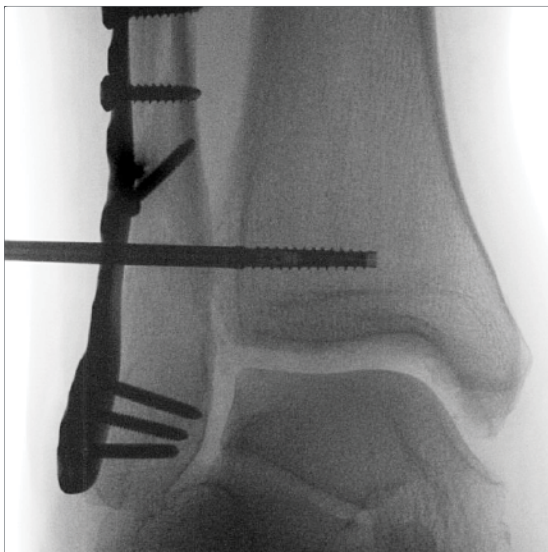
Figure 4. (B) Tibia screw placement

The tibial screw, which comes pre-attached to the driver, is advanced into the tibia. The surgeon will typically feel an increase in torque as the shoulder of the driver abuts the lateral cortex of the tibia. A mortise view with fluoroscopy should be obtained to confirm the tibial screw is fully seated and flush with the lateral tibial cortex, referencing the line of the fibula incisura.