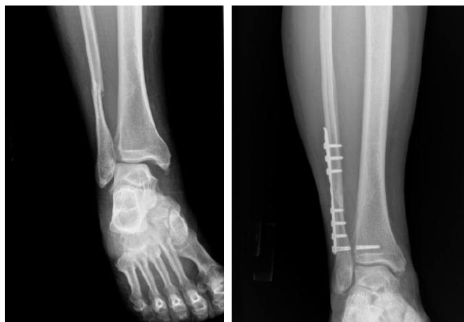
Figure 8. (A) PER Injury (B) 9-month follow-up