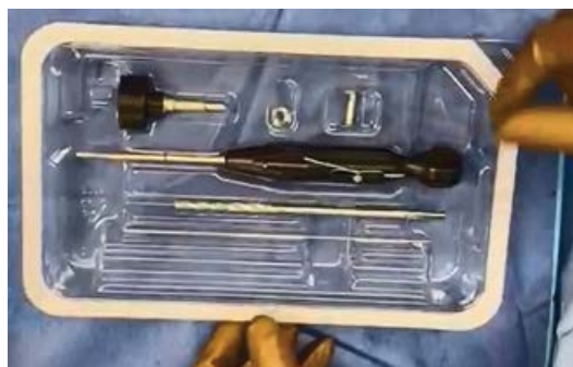
Figure 2. FIBULINK Implant Kit

All instrumentation required to insert the FIBULINK Implant is provided in a single-use sterile kit (Figure 2).