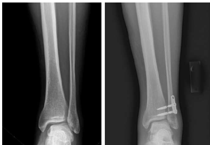
Figure 9. (A) Maisonneuve Injury (B) 10-month follow-up