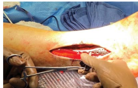
Figure 6. Link deployment and tensioning

Next, the suture will be unwound from the driver handle and the driver is pulled laterally to remove it. The tensioning knob with the appropriate fibula tensioning cap is placed over the guide tubes and slid into the hole drilled in the fibula. A hemostat is then clamped to the silver guide tube, and the guide tubes are pulled laterally to engage the external threads of the link to the internal threads of the tensioning cap.